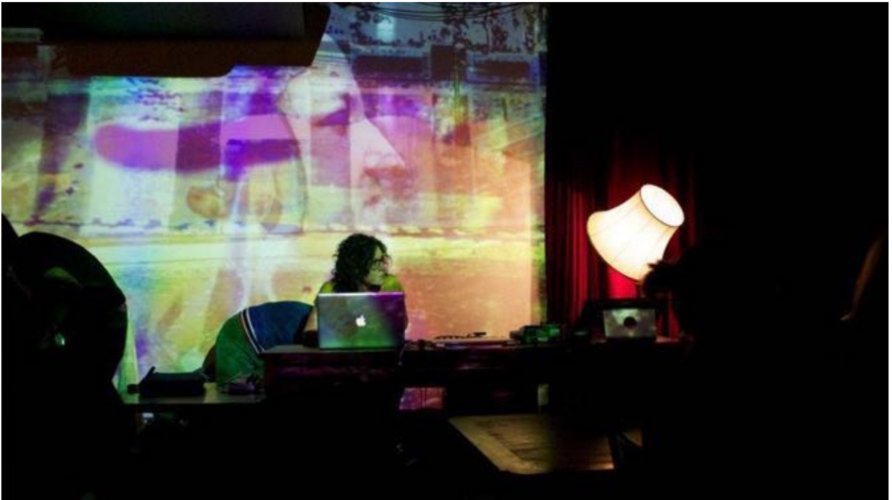
Echoes, 2012 live cinema performance