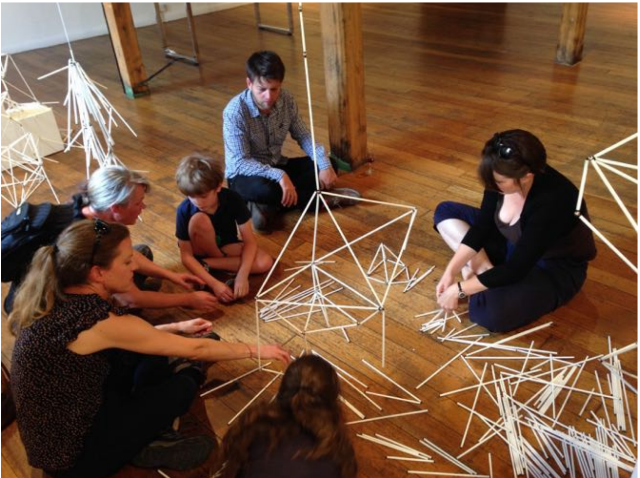
Postdigital construction, 2015

Wood, plaster, concrete, cardboard, acrylic, spray paint, foam, glass, plastic vials, florescent light. dimensions variable (approximately 350 x 180 x 150 cm)