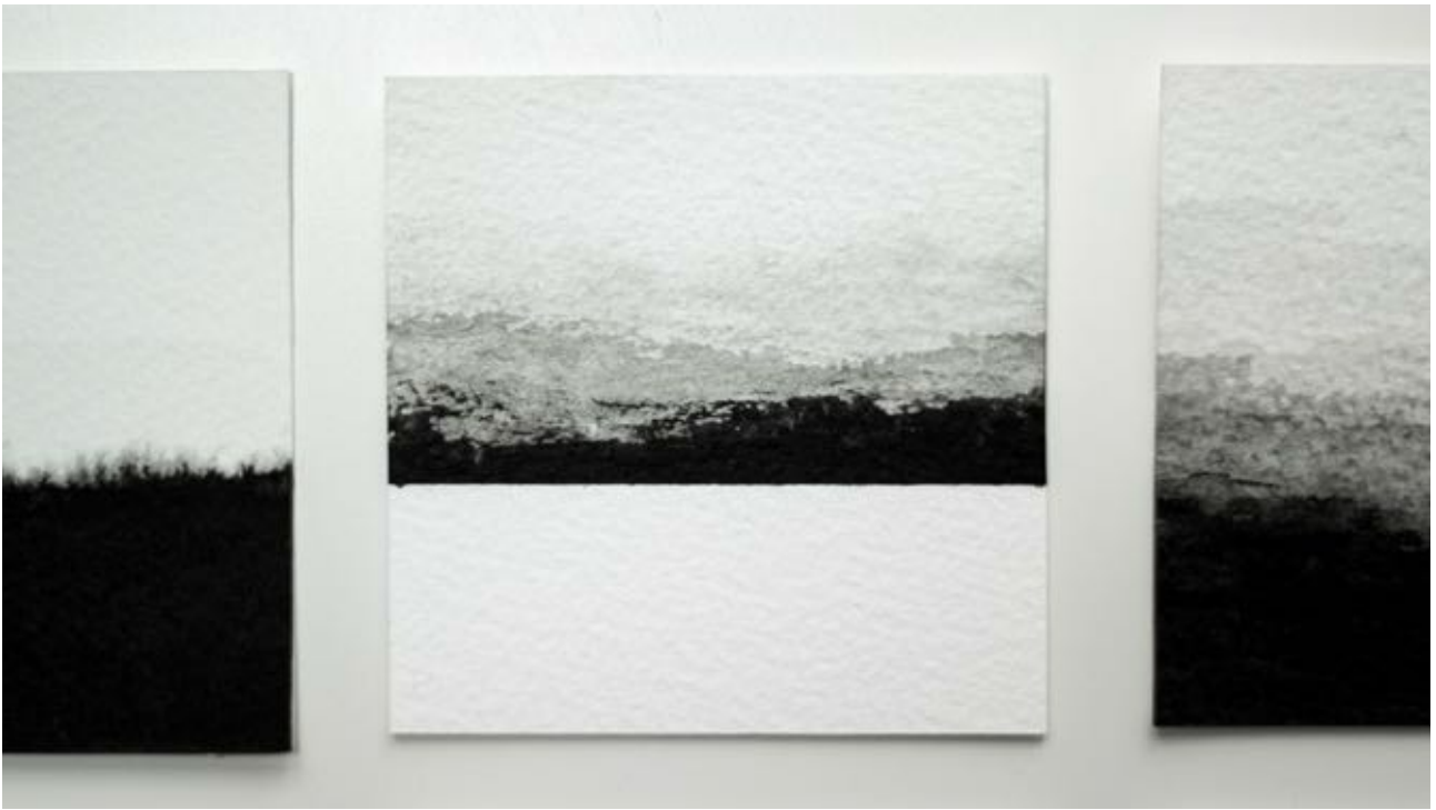
Inkscapes, 2014 indian ink on paper dimensions variable