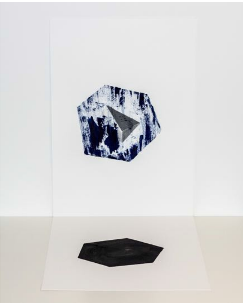
Shadows. Everybody has one 2015 pencil and oil on paper