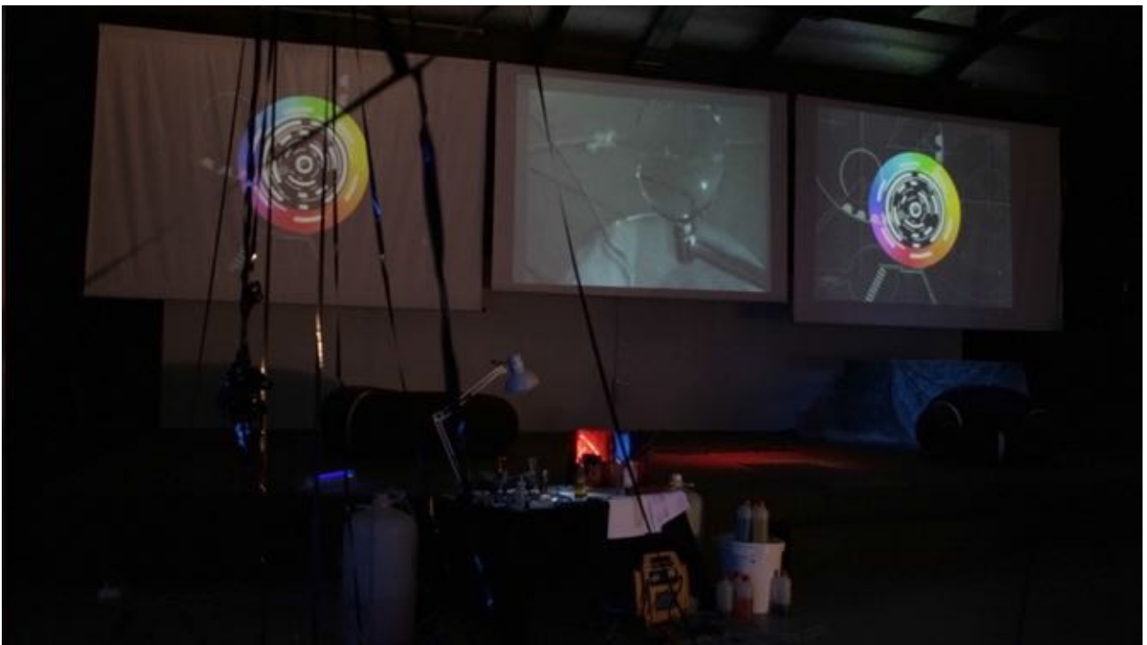
emötio, 2010 theatrical-immersive live cinema performance