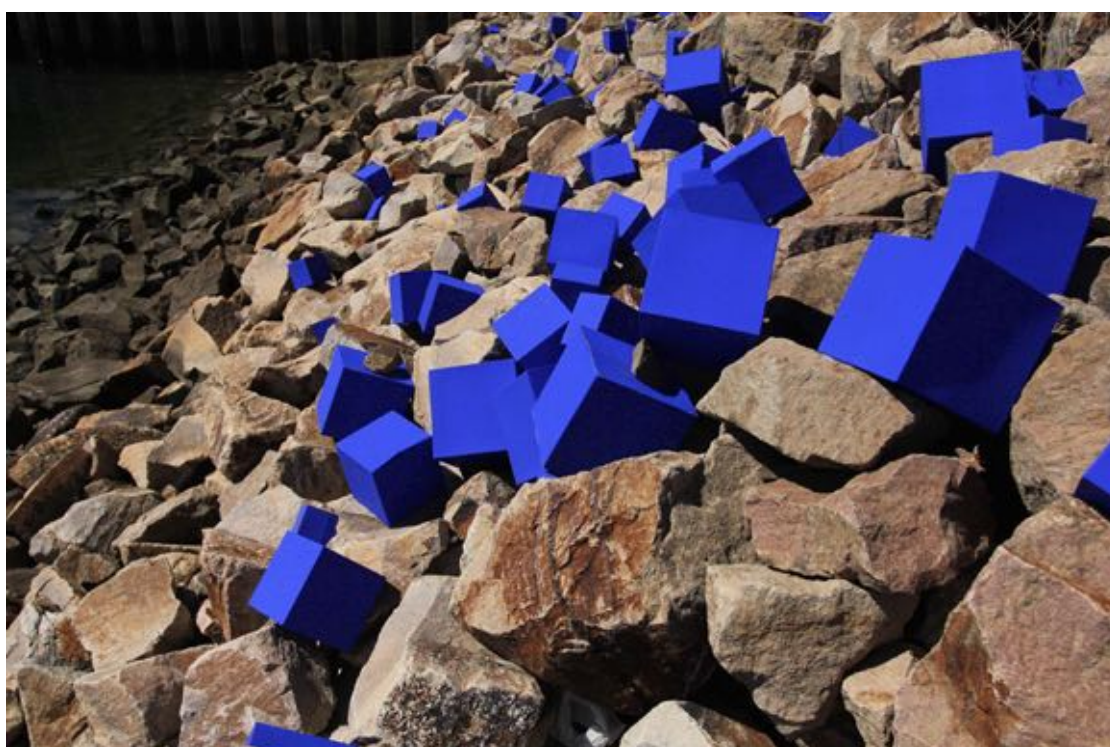
100 cubes (Klein blue), 2014 Acrylic paint & cardboard. Dimensions variable (250, 200 & 150mm cubes)