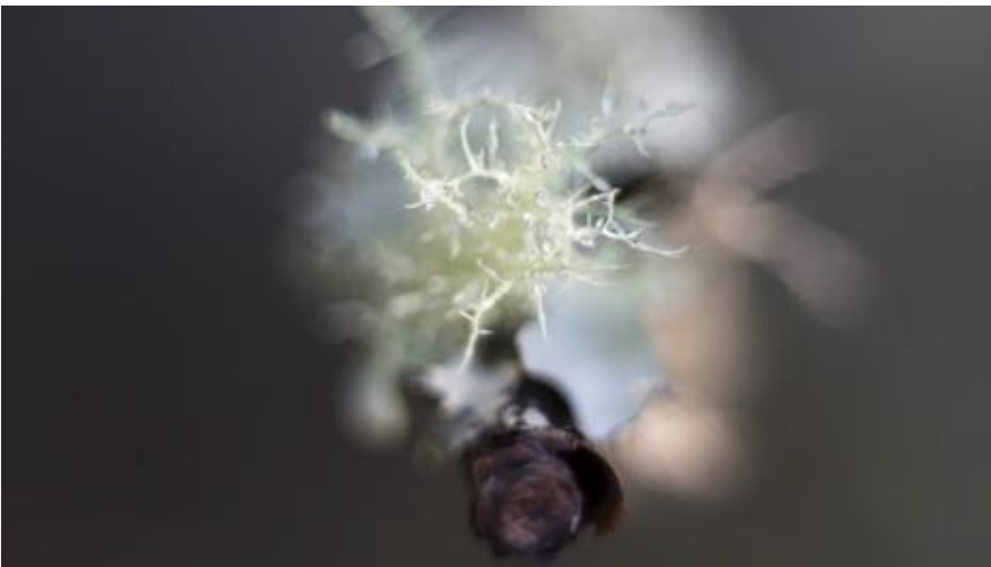
Orballo I, 2014 digital photography