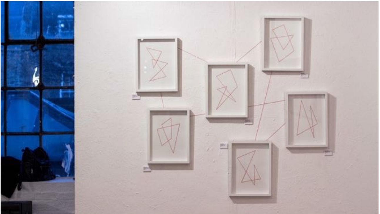
A friend of a friend, 2015 red thread on paper dimensions variable