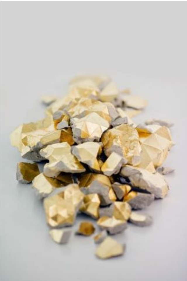
Postdigital Rubble (gold)

Concrete, shelving, double-walled polypropylene, adhesive vinyl, sticks, dental plaster, synthetic grass