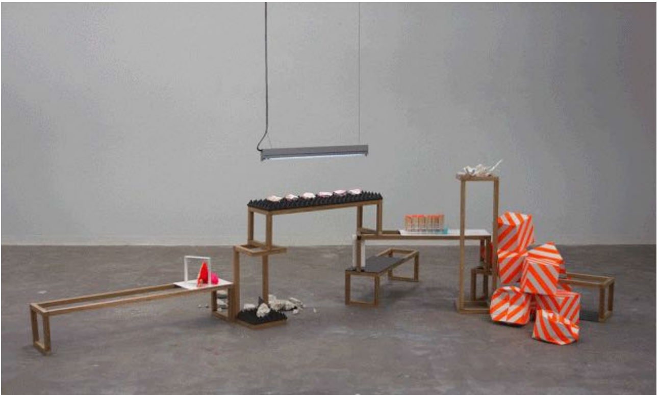
Postdigital Artefacts, 2013

Wood, plaster, concrete, cardboard, acrylic, spray paint, foam, glass, plastic vials, florescent light. dimensions variable (approximately 350 x 180 x 150 cm)